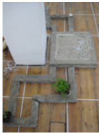
Phalanstère (25 th Simple Combined Series) , 2011

expanding foam, wood venetian blind, string, metallic gold spray paint, light blue spray paint