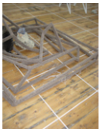
Solar Monument , 2011 Found carpet samples, thread, wood, demolition bricks