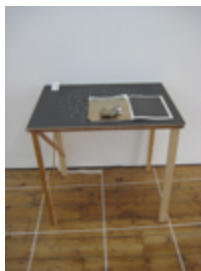
Dyson Sphere , 2011

cement, vapourshield plasterboard, cat litter, cat nip herbs