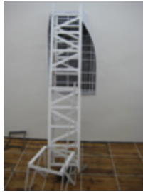
Speculative Programme , 2011 Wood venetian blinds, paint, glue, b/w digital print