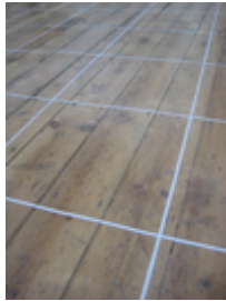
Continuous Monument , 2011 6mm pvc electrical tape

Untitled No. 1-4 (cats) , 2011 Live felines