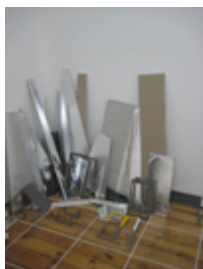
Local Occupiers , 2011 Vaporshield plasterboard, cardboard, rock-effect spray paint