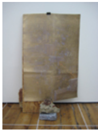
Natural History , 2011 Poster, metallic gold spray paint, Ford Metropolis blue spray paint, chip board, demolition brick.