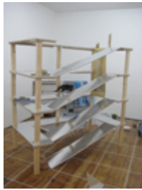
Unspecified, Ascending , 2011 Timber, laminated particle board, screws, vapourshield plasterboard, cement, poster, metallic gold spraypaint, contact paper, demolition brick