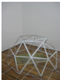
Dymaxion - Constant Idle System , 2011 Aluminium venetian blinds, zip ties, string, poster, metallic gold spray paint