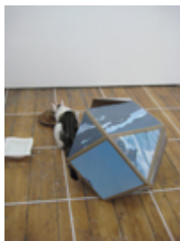
Dymaxion Map – Habitat , 2011 Wall mural, packing tape, carboard, carpet samples