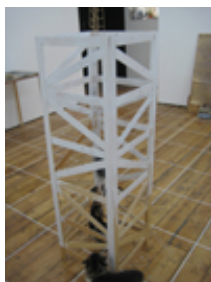
Public Realm , 2011

Timber, mdf, wood venetian blinds, screws, nails, b/w digital print, b/w photograph, book, demolition brick fragment, found image, gold metallic spray paint, contact paper