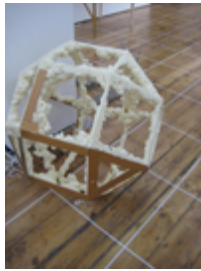
Rhombicuboctahedron , 2011

expanding foam, wood venetian blind, string, metallic gold spray paint, light blue spray paint